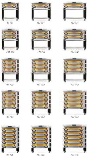
PM 700 Series