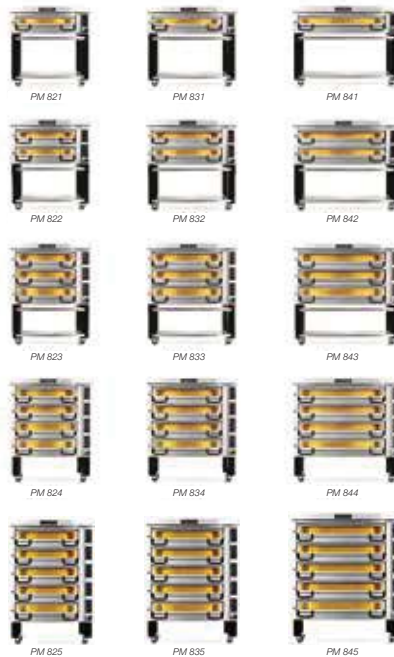
PM 800 Series