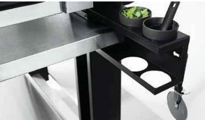
Oil - and spice rack for final touch