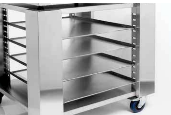
Support PM 451-S equipped with Shelf support package SP-1