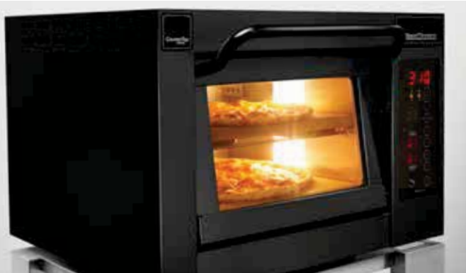
PM 351ED-1 made in Phantom Black