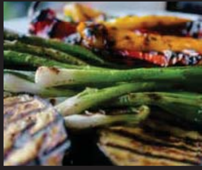
for Genuine MultiCooking