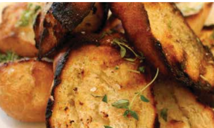
for Genuine MultiCooking

This can be crispy and shiny baguettes as well as any other type of bread like, traditional German or Mediterranean Bread, Italian delicacies like Ciabatta and Focaccia, Pastries like Croissant and Danish or local specialties like baklava. This is just a few examples of bread and pastries that can be baked in our ovens.