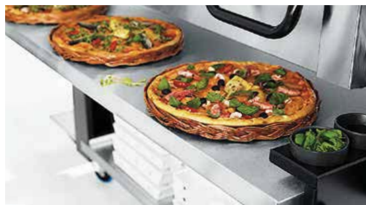
Retractable frontal unloading shelf lets you make or save space quickly and easily