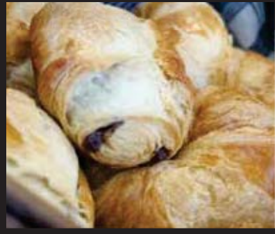
for Tastier Bread and Pastries