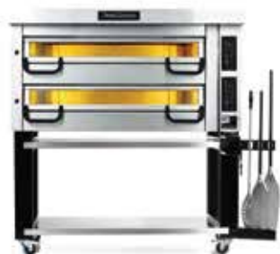
Model shown: PM 732ED, including extra equipment