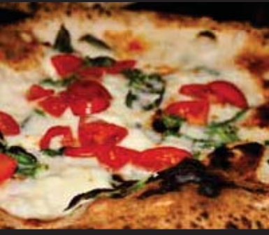
for True Artisan Pizza