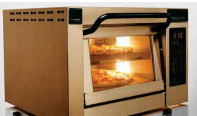
PM 351ED-1 made in Royal Gold