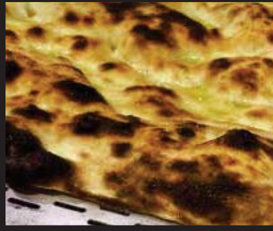
for High Temperature Baking