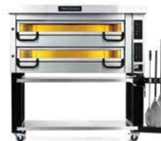
Model shown: PM 932ED, including extra equipment